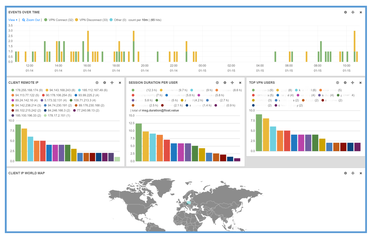
Figure: SSL VPN statistics—session duration, top VPN users, GeoIP.